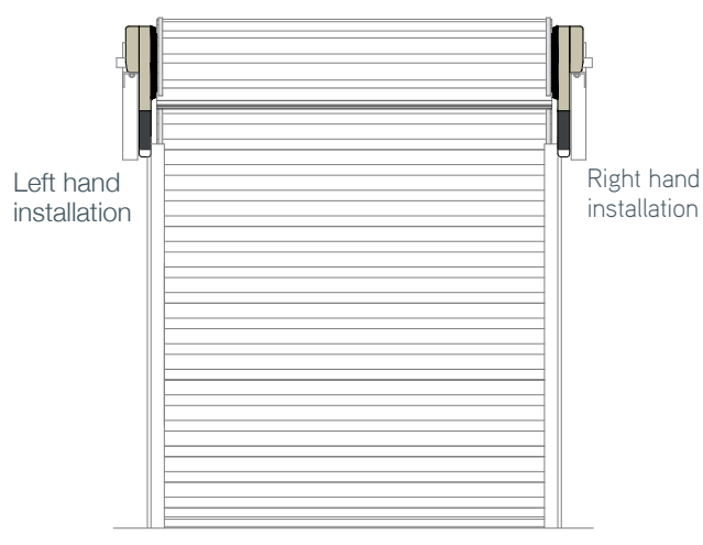
Max Door Height: 4.6m