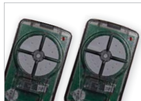
Two TrioCode™128 transmitters