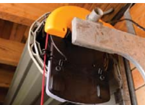
Opener with LED Courtesy Lights