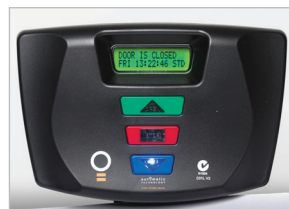
Wall Mounted LCD Control Panel