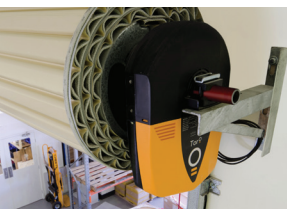
Opener with Battery Back Up