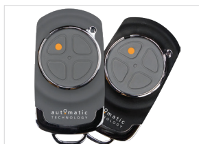
Two TrioCode™ 128 transmitters